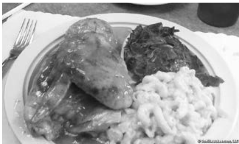
Baked chicken and stuffing, mac and cheese, and collard greens.