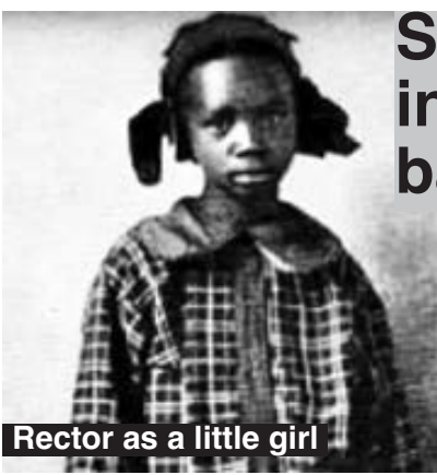
Rector as a little girl

This prompted Dubois to establish a Children's Department of the NAACP.