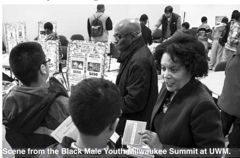
Scene from the Black Male Youth-Milwaukee Summit at UWM.