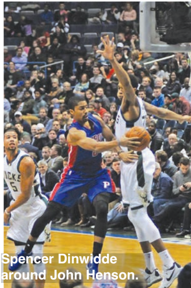
Spencer Dinwiddie around John Henson.