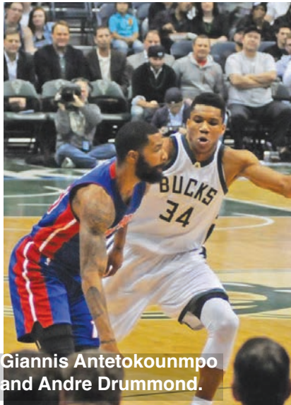
Giannis Antetokounmpo and Andre Drummond.