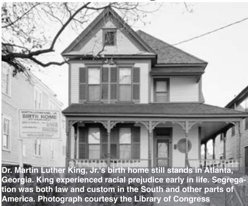
Dr. Martin Luther King, Jr.'s birth home still stands in Atlanta, Georgia. King experienced racial prejudice early in life. Segregation was both law and custom in the South and other parts of America.