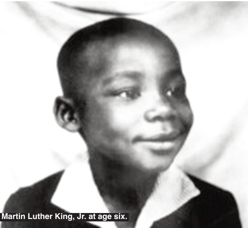
Martin Luther King, Jr. at age six.