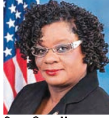
Cong. Gwen Moore

I want him to see exactly what his opposition looks like. When he sees me, I want him to see The Resistance.