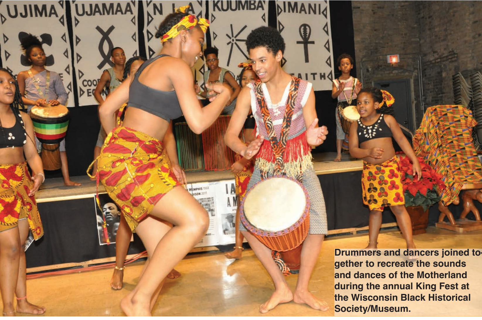
Drummers and dancers joined together to recreate the sounds and dances of the Motherland during the annual King Fest at the Wisconsin Black Historical Society/Museum.