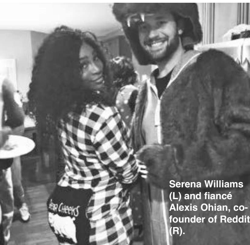
Serena Williams (L) and fiancé Alexis Ohanian, co-founder of Reddit (R).