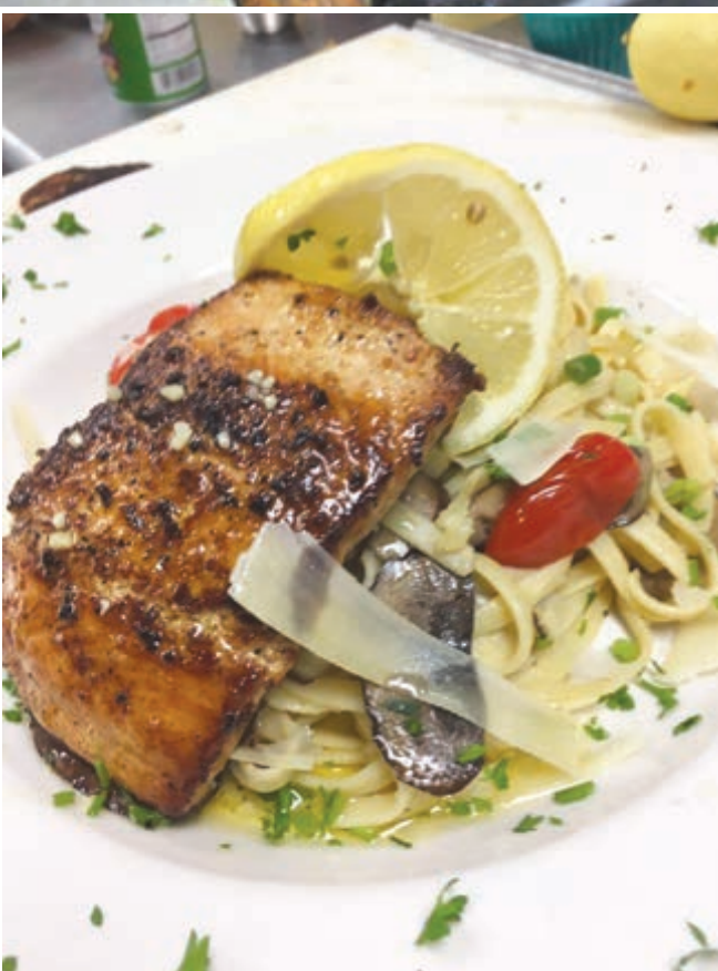
One of the many seafood dishes that can be found at Monterrey Smoke House

* See list of Black Restaurant Week participants on page 2