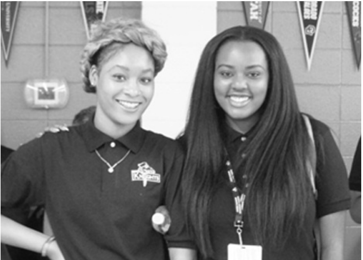
Two students from James Madison Academic Campus, located at 8135 W. Florist Avenue.