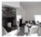
Lower Level Capacity 75